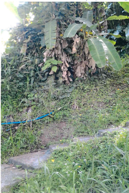
LOCATION : HIGHLANDS ROAD MORIAH, TOBAGO