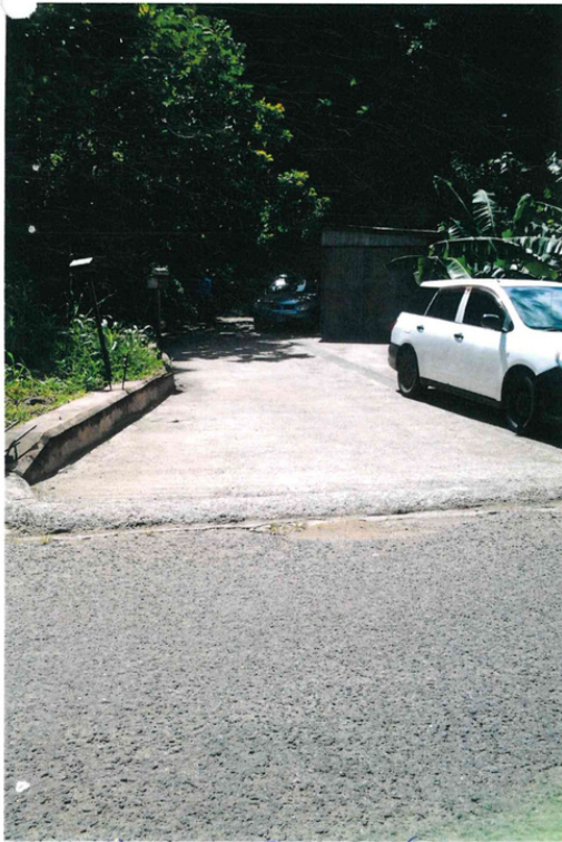
VIEW FROM ROADWAY (ENTRANCE)

Two (2) Lots of Freehold Land situated at Highlands Road, Moriah, TOBAGO