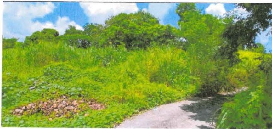
SITE VIEW LOOKING NORTH-WEST