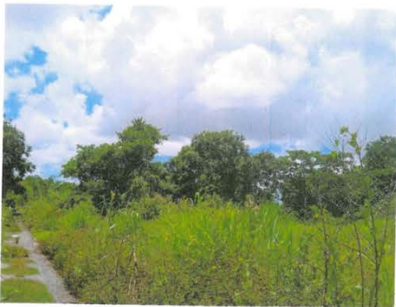
SITE VIEW LOOKING SOUTH