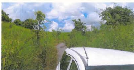
ROAD VIEW LOOKING NORTH-WEST